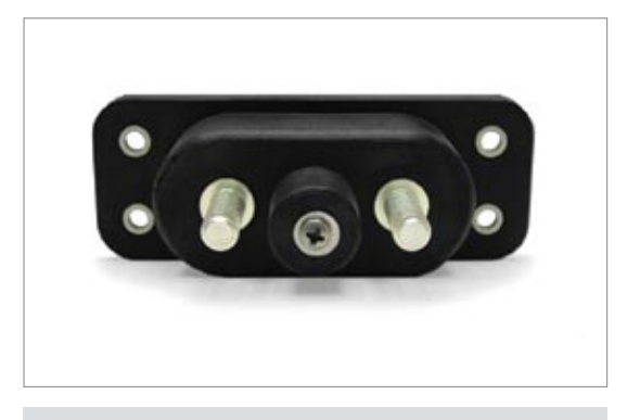
Figure 2: Tesla™ DC Battery Receptacle -- Back View