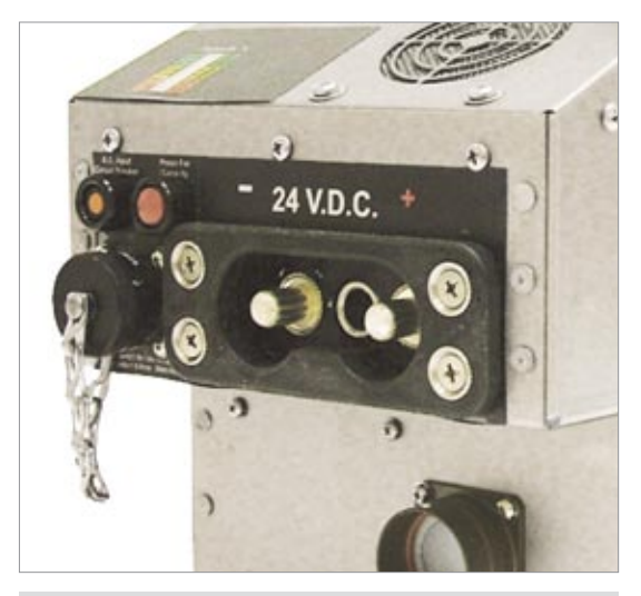
Figure 1: All Tesla™ MPU's and GPU's are fitted with Tesla™ DC Battery Receptacles

With a two-year warranty, Tesla's<sup>™</sup> DC Battery Receptacles are reliable, durable, and will easily integrate into your current product configuration. Best of all, they are in stock for immediate delivery. Call Tesla<sup>™</sup> Customer Service at (302) 324-8910 for more details on volume pricing.