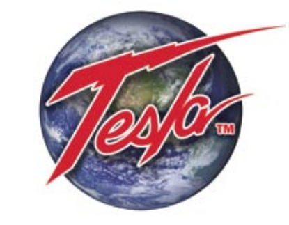
Power Anytime, Anywhere

The Tesla™ NATO DC Inline Receptacle is a high-quality NATO dc receptacle for your vehicle. The Tesla™ DC Inline Receptacle is constructed from a rugged combination of advanced composite materials and corrosion-resistant alloys for maximum conductivity and durability. The result is a NATO receptacle that will withstand the harshest battlefield conditions and other extreme environments.