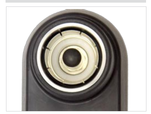
Figure 4: Sealed and easily replaceable contacts