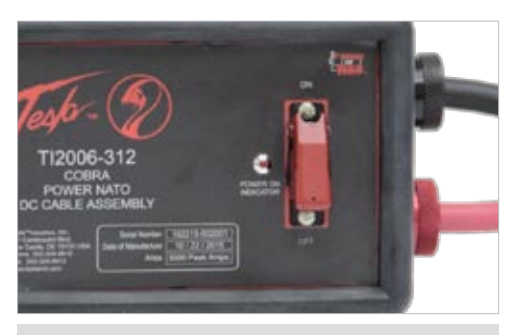
Figure 2: Electronics Control Enclosure