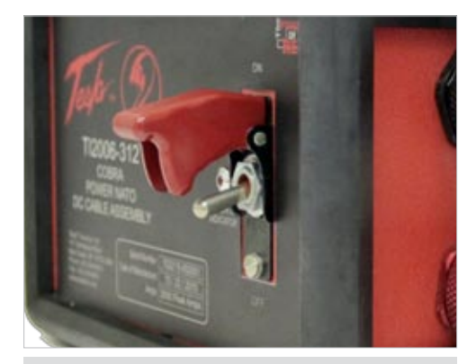
Figure 1: Power ON/OFF Switch and Indicator

Contacts can be easily replaced "in-the-field" without discarding the entire plug using the Insertion/Extraction Tools. The tools and contact replacements can be ordered through Tesla™ Customer Service at (302) 324-8910.