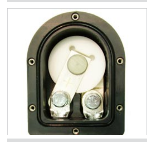
Figure 3: Easily accessible terminal lugs